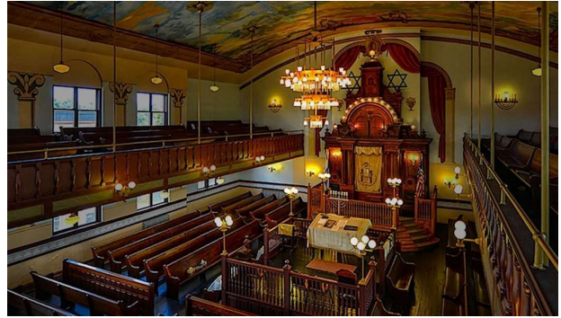
Walnut Street Synagogue, 145 Walnut Street, PO Box 505265, Chelsea, MA 02150-5265 Contact us at: central.walnutstreetshul@gmail.com